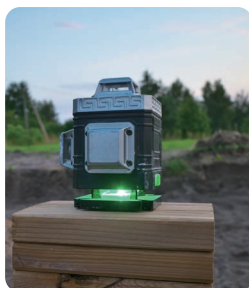
Portable lights and instruments