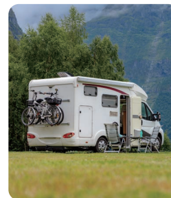
Caravan & camping