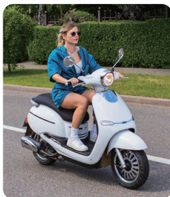
Electric vehicles electric mobility