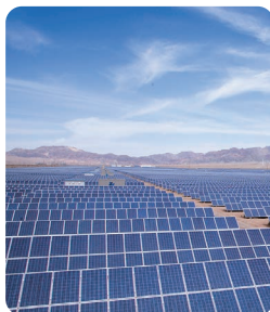
Solar/wind energy storage system